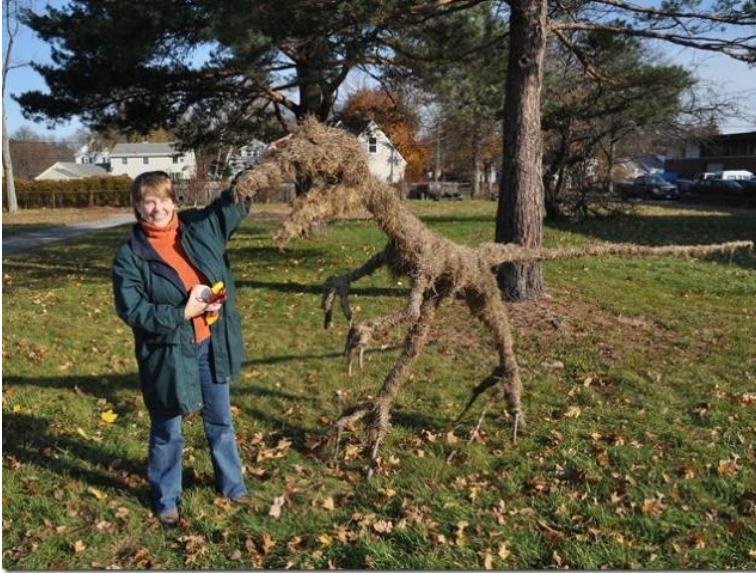
Northampton, and Holyoke to Springfield

of the earliest discovery of fossil dinosaur footprints known to science. In 1835, it was here in the East, rather than the West, that the first American dinosaur remains were found, seven years before the word dinosaur was coined. It was thought at the time the tracks had been made by prehistoric birds. The region of track sites follows the river from Northfield through Gill, Greenfield, Montague, Deerfield, Sunderland, Amherst, South Hadley, Chicopee,