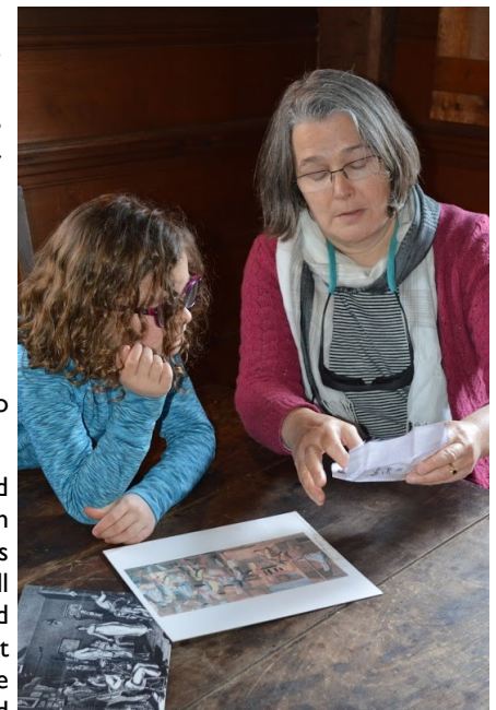
Photos above and left are of participants enjoying our April 14th hands-on programs for members, supporters and friends. The programs were designed to illustrate what happens during typical field trip activities at the Indian House.